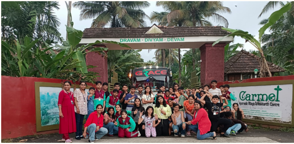
Location: Carmel Tourism Village @ Bhoothathankettu, Kothamangalam

Grades 5 to 8 students went on a One-day trip to a fascinating resort 65 kms away from Kochi. Refreshed from the welcoming drink that was provided on arrival, the middle graders set off to trek through the Bhoothankettu forest with a guide. Enjoying the sounds of different birds and animals as they moved, the children also quickly learned the identities of the different varieties of trees. The trek concluded with a visit to a cave, where ancient kings kept their weapons stored. The children then washed off their morning exhaustion with enjoyable rides in the resort's biopark. Post-lunch, the students visited several varieties of gardens, an aquarium and a koala joey's pet park. This was followed by a magic show, where the magician talked about snake bites. He also gave students tips on prevention of snake bites, as well as the first aid to be given in such cases. The trip concluded with the students enjoying themselves in the water games park. All returned exhausted but happy at such an enjoyable day.